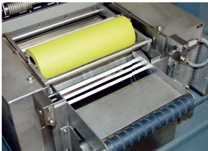
Inlet plate with return slots

Should you have any questions, please contact us by phone or email.