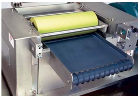
Inlet plate without return slots