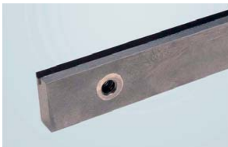
Blade with diamond cutting edge