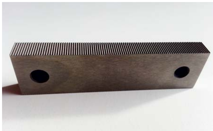
Tungsten carbide blade with strand guiding grooves for soft polymers

Should you have any questions, please contact us by phone or email.